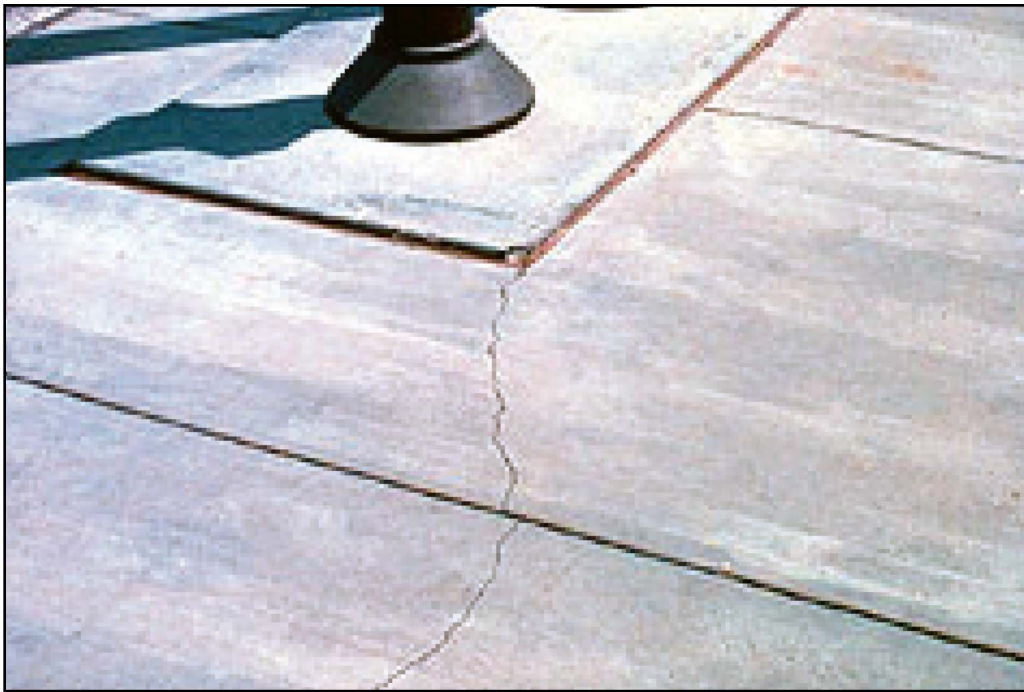
Figure 3. Drying Shrinkage Cracking.