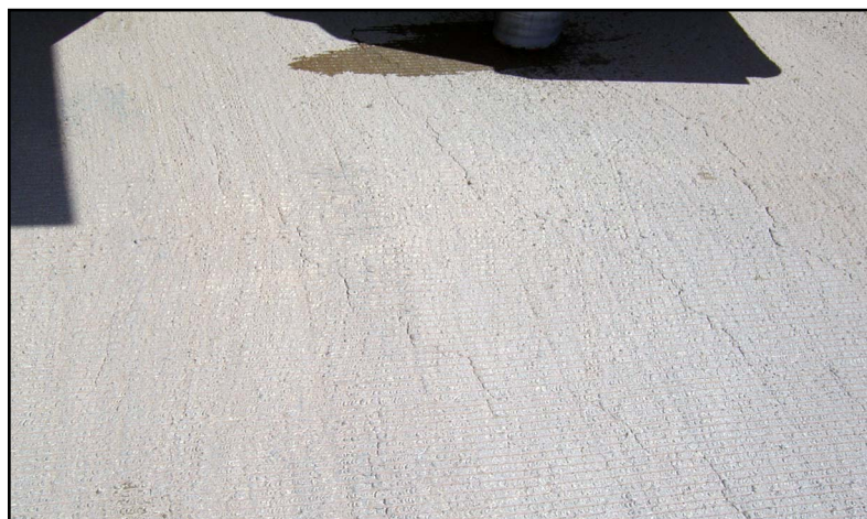
Figure 1. Example of plastic shrinkage cracking. Note, the closely spaced, parallel cracking.

Plastic shrinkage cracking occurs when the concrete is in the plastic state, which is within the first 24 hours after the cement begins to hydrate. In addition, plastic shrinkage cracks are usually spaced 1 to 3 feet apart, are generally parallel to one another, do not generally extend to the free end of the concrete element, and can be of considerable depth 1 . Figure 1 shows an example of plastic shrinkage cracks on the surface of a pavement. Figure 2 demonstrates the depth these types of cracks can reach.