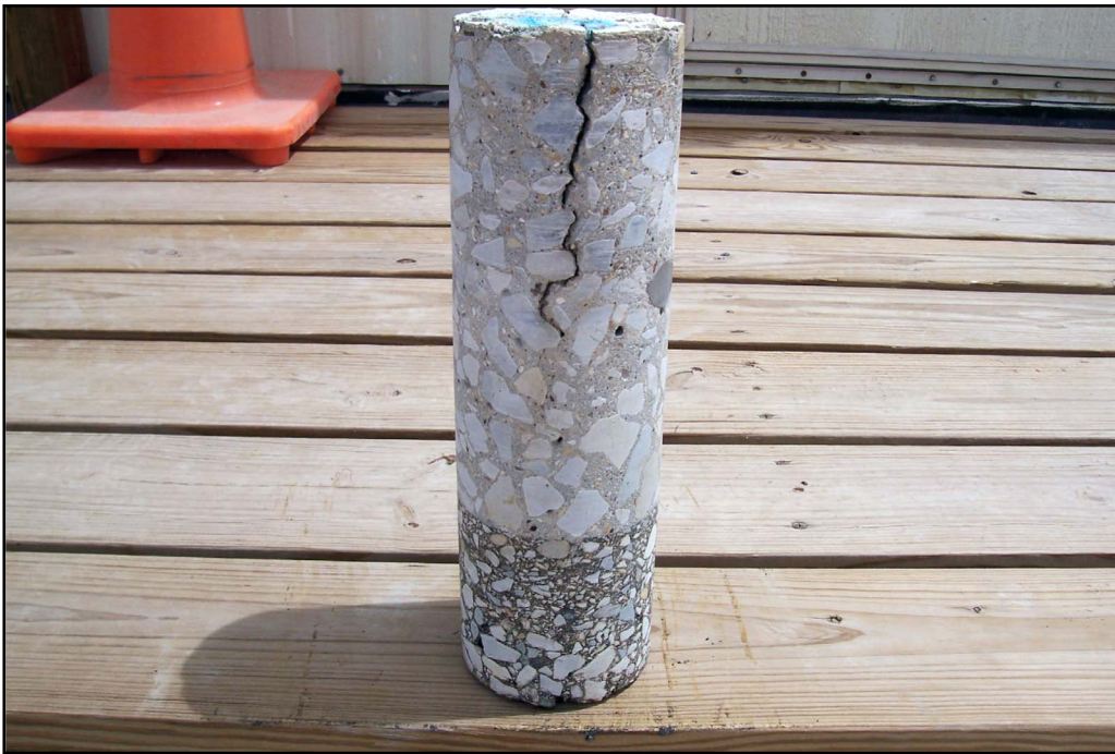
Figure 2. Deep Plastic Shrinkage Crack (below mid-depth).