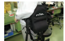
④-2 Working Belt in Action