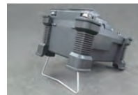
③ Angled Stand in Action