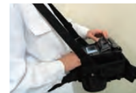
④-1 Working Belt in Action