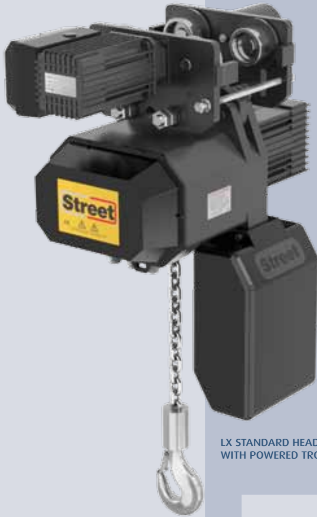
LX STANDARD HEADROOM HOIST WITH POWERED TROLLEY