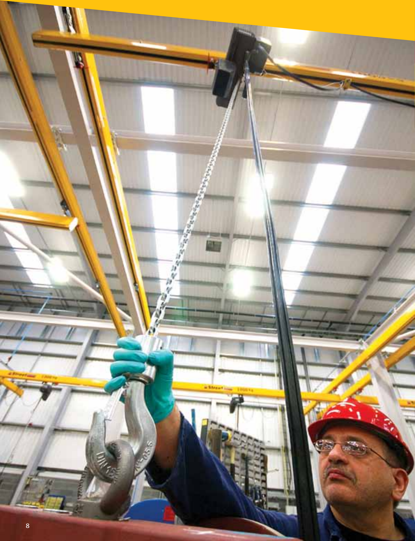
LX Chain Hoist Applications: Street 'LCS profile' crane