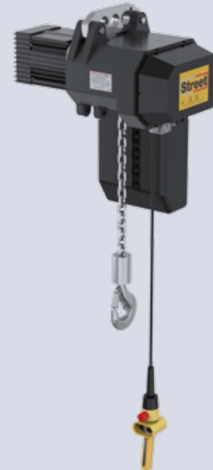
LX EYE SUSPENSION HOIST