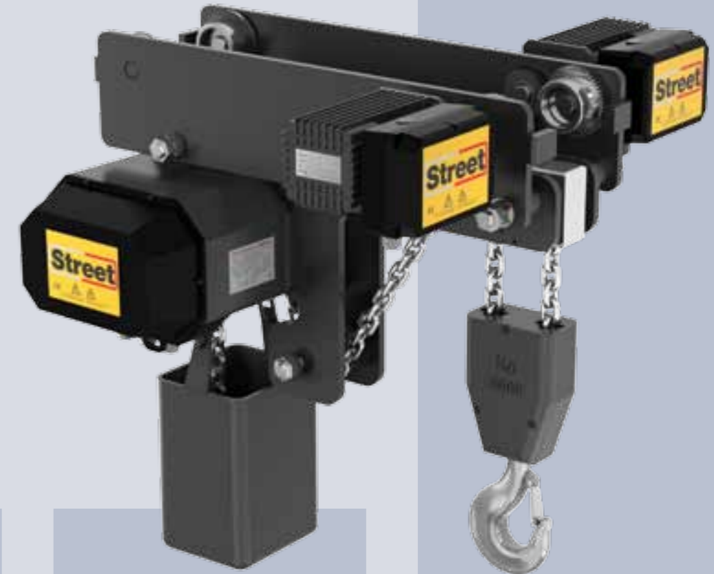
LX LOW HEADROOM HOIST WITH POWER TROLLEY