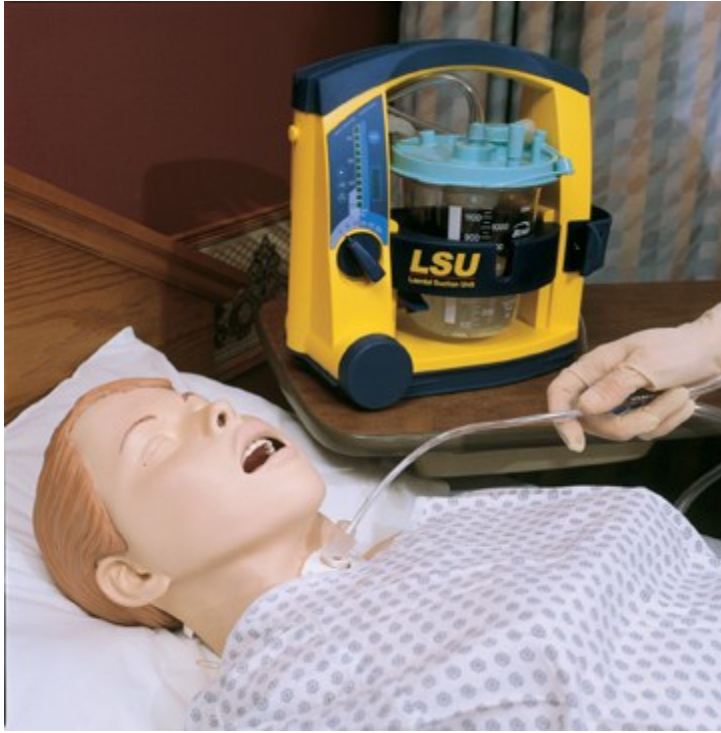
Tracheostomy care and tracheal suctioning.