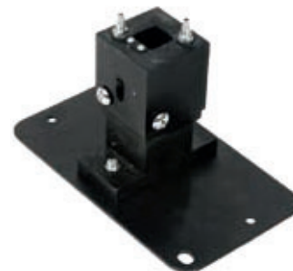
Cat. No. 18900335 10mm water-jacketed (for SCI-V1100 & SCI-UV1100)