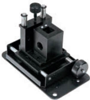
Cat. No. 18900337 Micro Cell holder