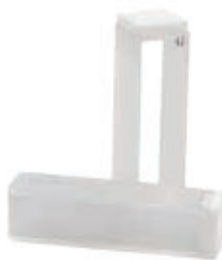
Square cuvettes glass/quartz 1-5mm/10-100mm