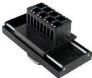
Cat. No. 18900340 8-position auto cell changer (for SCI-V1100&SP-UV1100)