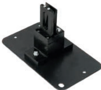
Cat. No. 18900339 solid sample holder (ø1.5-3mmø 1 position)