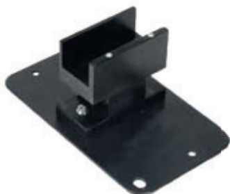
Cat. No. 18900334 cylindrical cell holder(ø16mm)