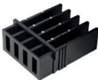
Cat. No. 18900333 4-cell holder for up to 100mm sq. cuvette