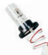
Cat. No. 18900342 Milas deuterium lamp, 10V, 300mA, 30W (for SCI-UV1000 & SCI-UV1100)