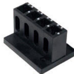
Cat. No. 18900331 4-cell holder for 10mm sq. cuvette