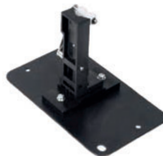
Cat. No. 18900338 Test tube holder(ø8-ø22mm)