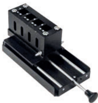
Cat. No. 18900336 10mm water-jacketed 4-cell holder (for SCI-V1100 & SCI-UV1100)