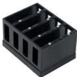
Cat. No. 18900332 4-cell holder for 10mm to 50mm sq. cuvette