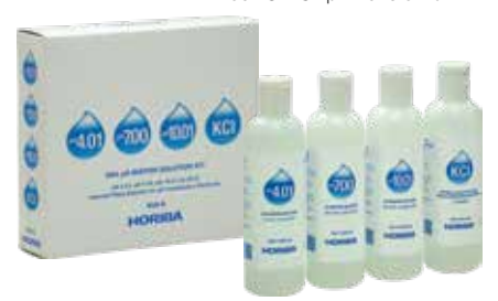
502-S USA pH Buffers Kit