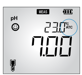
Temperature sensor connected