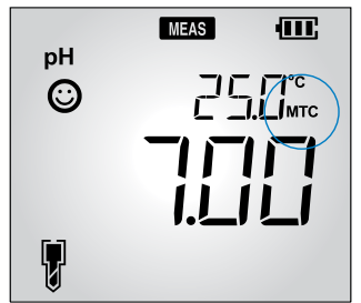
Temperature sensor disconnected