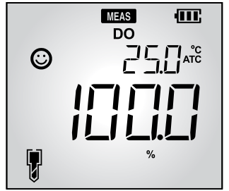
Dissolved Oxygen Display