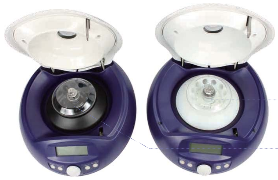
D2012 with A12-2 aluminum alloy rotor kit