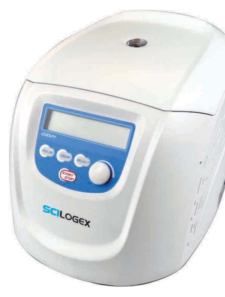
D3024 with AS24-2 aluminum alloy rotor kit