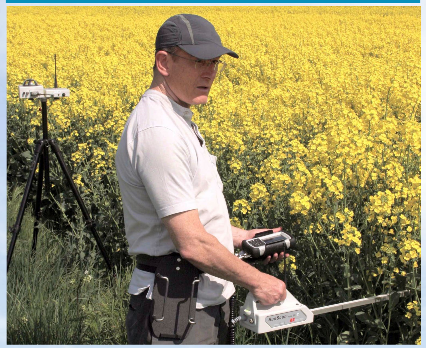
SunScan Probe (radio version) and PDA, with radio-linked BF5 Sunshine Sensor mounted on tripod