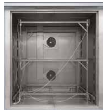
Pluggable frame for measurement for forced convection chamber furnace N 7920/45 HAS