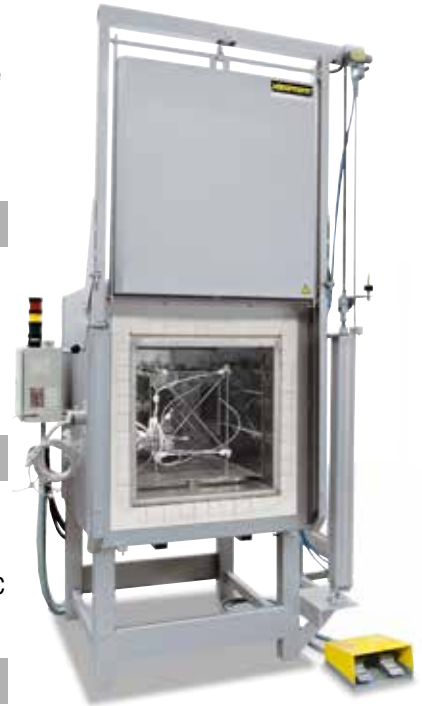
Holding frame for measurement of temperature uniformity

In standard furnaces, temperature uniformity is guaranteed as +/- K without measurement of temperature uniformity. However, as an additional feature, a temperature uniformity measurement at a target temperature in the work space compliant with DIN 17052-1 can be ordered. Depending on the furnace model, a holding frame which is equivalent in size to the work space is inserted into the furnace. This frame holds thermocouples at up to 11 defined measurement positions. The measurement of the temperature uniformity is performed at a target temperature specified by the customer after a static condition has been reached. If necessary, different target temperatures or a defined target working temperature range can also be calibrated.