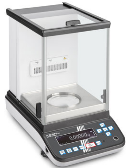
2 KERN ABP 100-5DM with optional ionizer

1 NEW: Extremely fast ionization process, thanks to the latest generation of KERN ionization technology to neutralise electrostatic charge for fixed installation in the analytical balance. Particularly convenient handling as you no longer need a separate device. Simply enable the ionizer fan at the push of a button. Suitable for all models