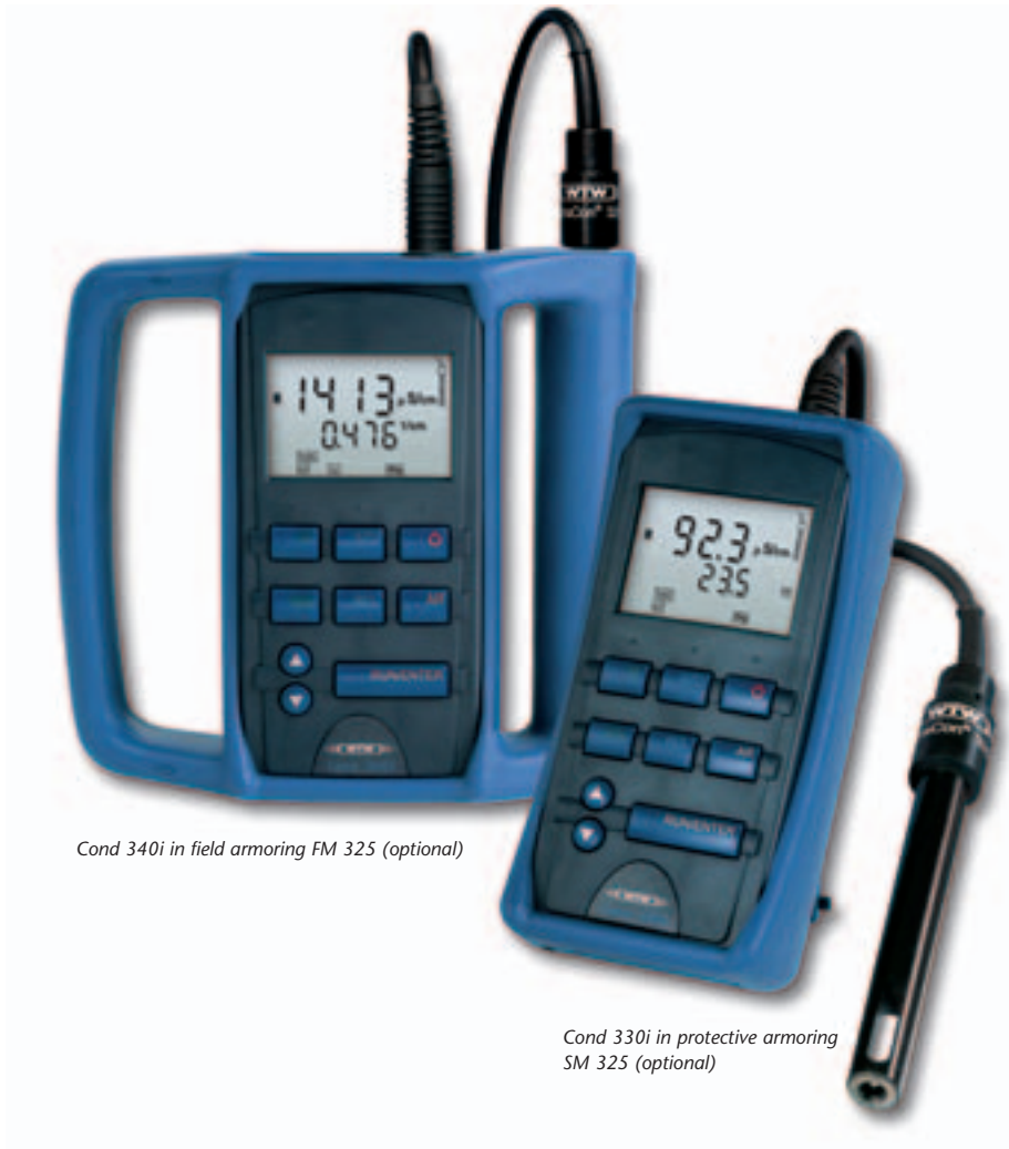
Cond 340i in field armoring FM 325 (optional)