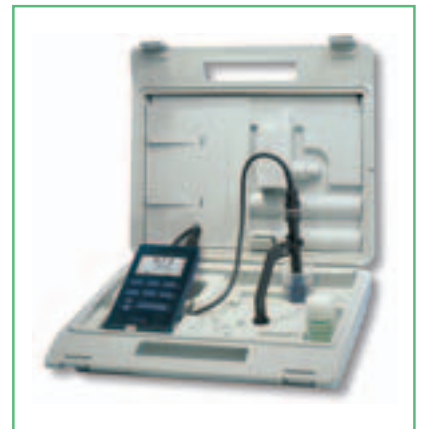
Complete as SET