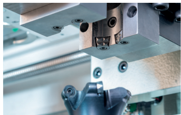
Custom made clamping jaws and milling heads