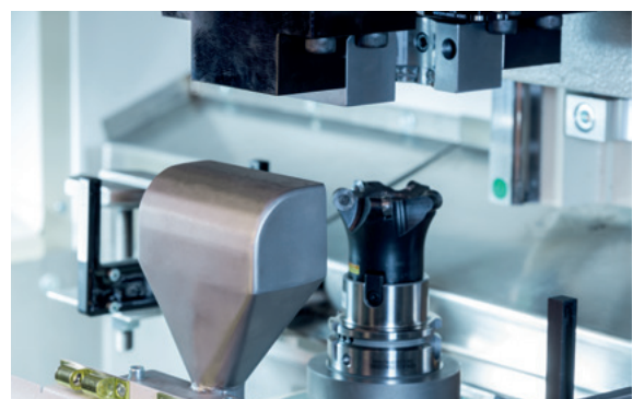
Chip collecting unit (CCU)