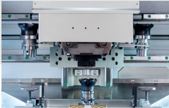
Tool changing system