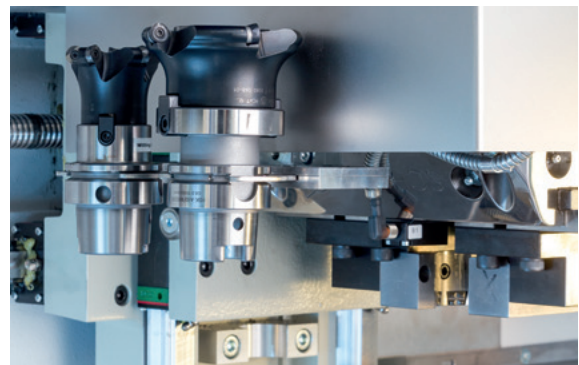
Up to 4 milling heads in the system

The design of the HS-F1000 guarantees high flexibility to meet the particular needs of the customer. During manual operation, the operator inserts samples via the front door. The default input position is on the left machine side but might be easily changed to the right side. In automatic mode, samples can be inserted either via the lateral or the back-loading openings using a robot, conveyor belt or magazine. The different access possibilities open up many options to integrate the HS-F1000 in any kind of automation setup. Even individual configurations and layouts can be realized without constructive changes of the machine. This gives you both maximum planning freedom and significant time and cost savings for your project.