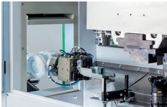
Optional robot access from the site