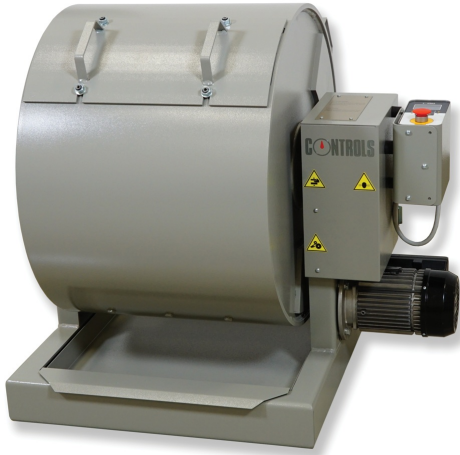
Los Angeles abrasion machine model 48-D0500/G