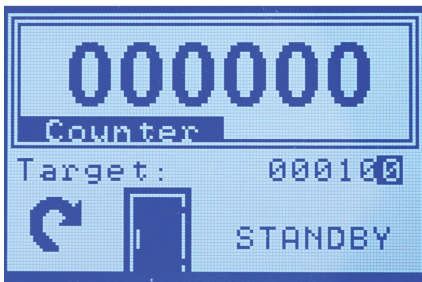
Los Angeles abrasion machine model 48-D0500/G - example of the graphic display screen