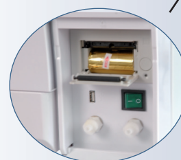
MICRO PRINTER AND USB PORT

This BTE-23D adopts 3 times pre-fractionated vacuum system, the following chart simply describes the status of its process