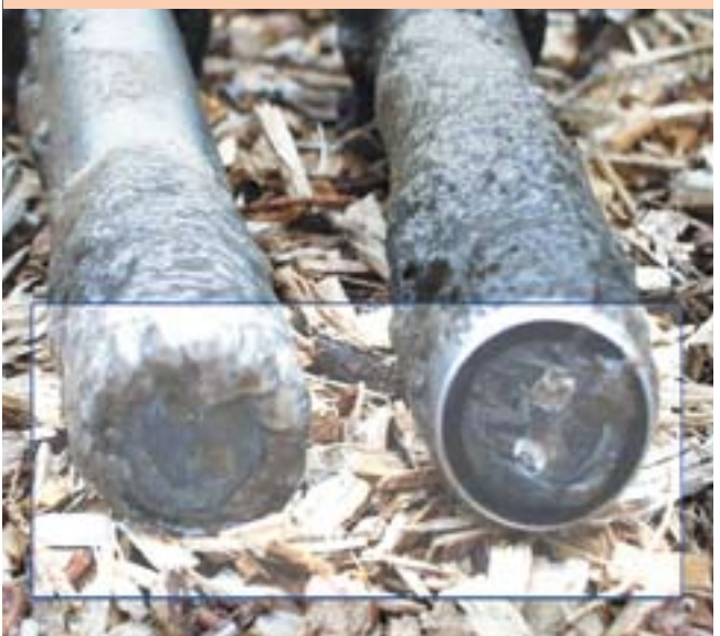
Sensor without and with ultrasound cleaning system after 30 days

The sapphire measuring windows are particularly scratchproof and guarantee accurate measuring results even with permanent use under rough ambient conditions.