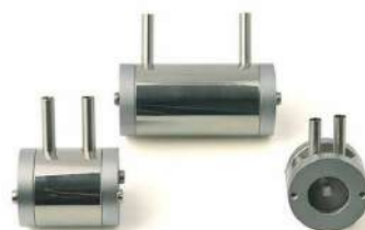
Low volume XPC tubes