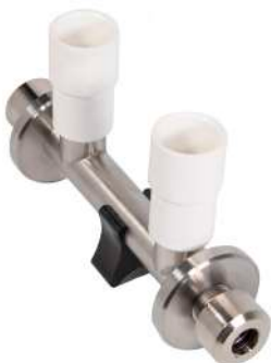
Standard XPC tubes

Special tubes, HCl (hydrochloric acid) tubes, XPC Adaptors and cover glasses for ultra-violet measurement are also available. Please visit our website for further details.