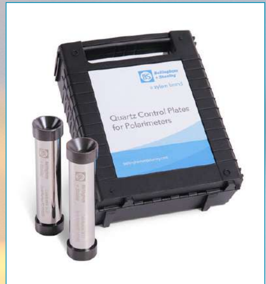
Fig 2. Quartz Plates, available in single or multiple box sets

In order to better suit customer needs, ADP600 Series polarimeters are now designed around a modular selection guide. This approach means customers will have everything they need for their application without spending excess money on things that they don't.