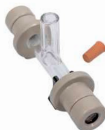
HCl XPC tubes