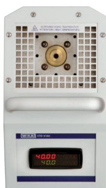
Temperature dry-well calibrator model CTD9100-650

The CTD9100-450 is used in the medium temperature range up to 450 °C. It generates its temperature with resistive electrical heating and features an enlarged insert with Ø 60 mm. Thus, it is possible to calibrate several temperature probes simultaneously without the need of changing the insert.