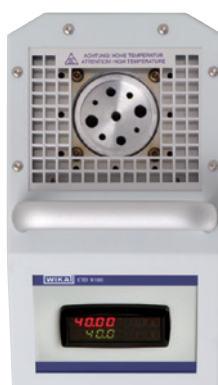
Temperature dry-well calibrator model CTD9100-450

These calibrators operate using Peltier elements and, as a result, can achieve testing temperatures below the ambient temperature. Due to their capacity for active cooling, they are often used in the biotechnology, pharmaceutical and food industries. The CTD9100-165-X features an enlarged insert with Ø 60 mm. Thus, it is possible to calibrate several temperature probes simultaneously without the need of changing the insert.