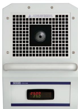
Temperature dry-well calibrator model CTD9100-165 or model CTD9100-COOL

Four instruments for the temperature range from -55 ... +650 °C