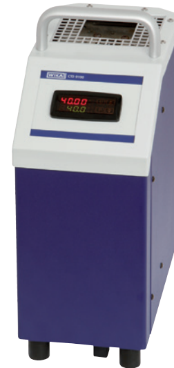
Temperature dry-well calibrator CTD9100-650