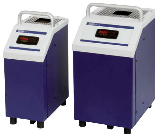
Temperature dry-well calibrators model CTD9100