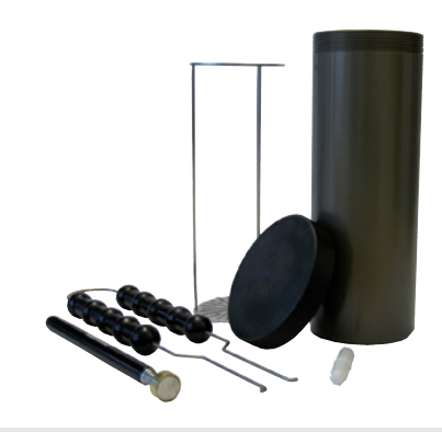
Insert for liquids with accessories

Temperature micro calibration baths Fig. left: model CTB9100-165 Fig. right: model CTB9100-225