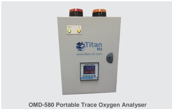
OMD-580 Portable Trace Oxygen Analyser

Our Oxygen Analysers have weather and explosion proof casings, making them suitable for a wide range of applications and installation options. Our Oxygen Analysers combine innovative thermo-paramagnetic technology with high accuracy and quality performance.