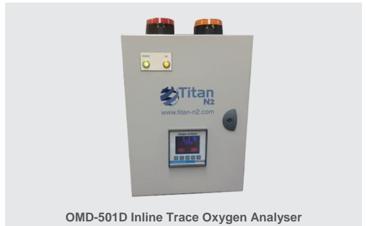
OMD-501D Inline Trace Oxygen Analyser