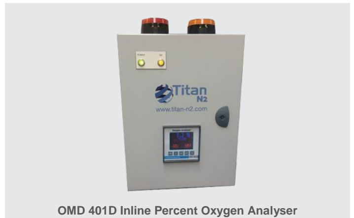
OMD 401D Inline Percent Oxygen Analyser