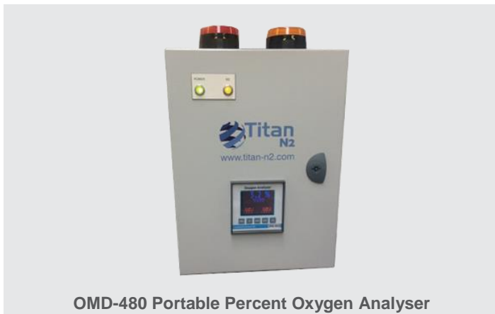
OMD-480 Portable Percent Oxygen Analyser