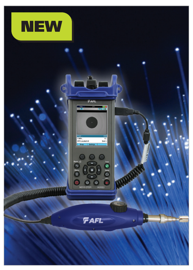
M210 OTDR with DFS1 Digital FiberScope