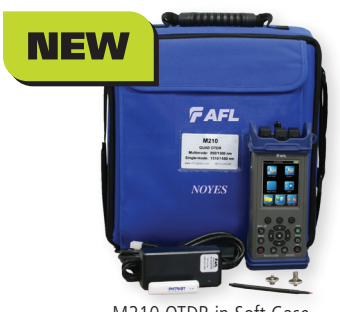
M210 OTDR in Soft Case