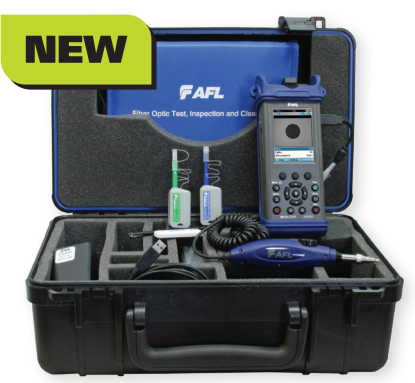
M210 QUAD Test and Inspection Kit (Tier 2)