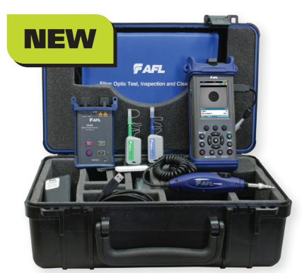
M210 QUAD Certification Kit (Tier 1 and Tier 2)