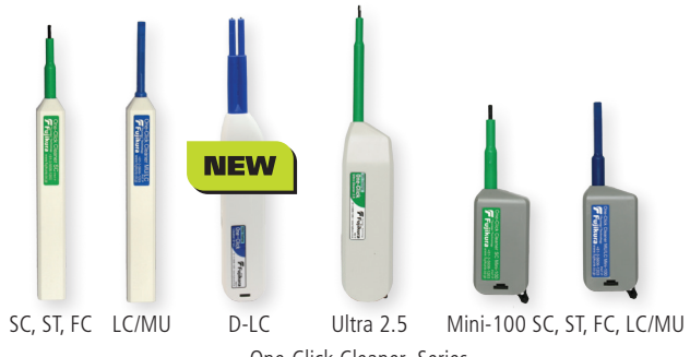
One-Click Cleaner Series