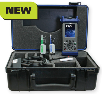
M210 OTDR in Hard Transit Case