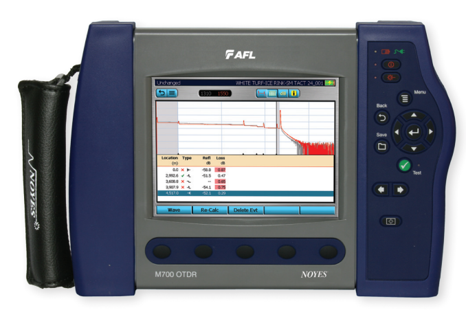
M700 Compact QUAD OTDR