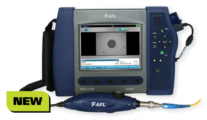
M700 OTDR with DFS1 Digital FiberScope