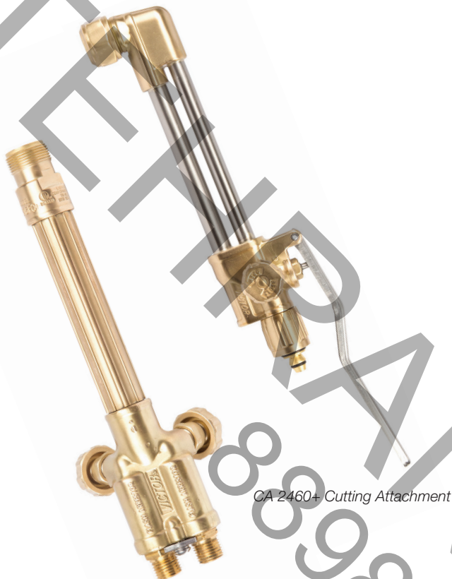
WH 315FC+ welding handle

High capacity, heavy-duty welding handle and cutting attachment