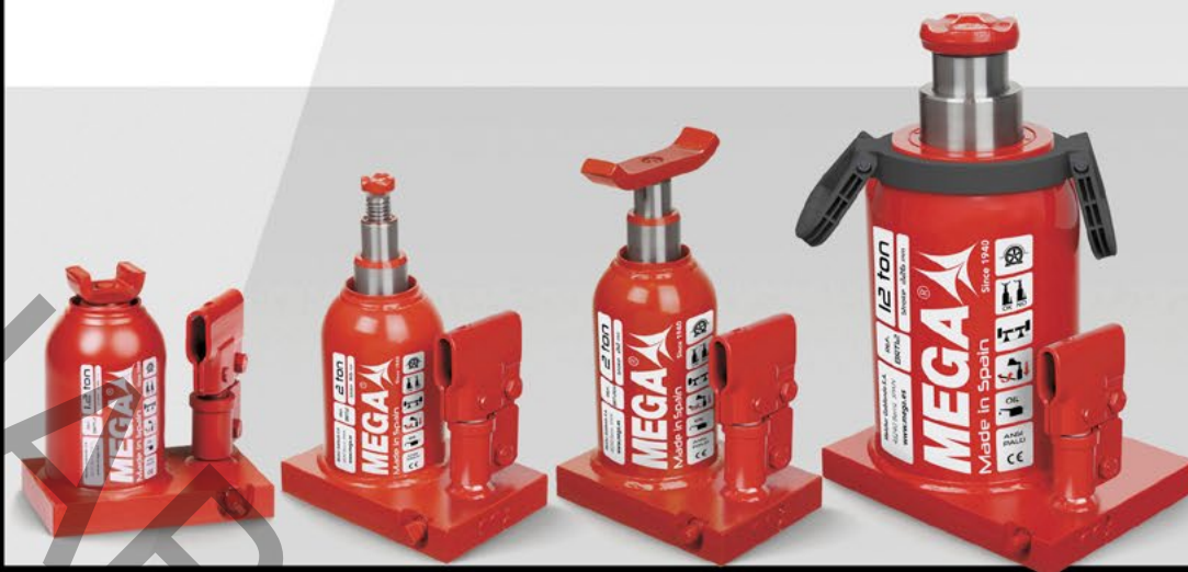
BRT1.2 BRT2 BRT2EM BRT12