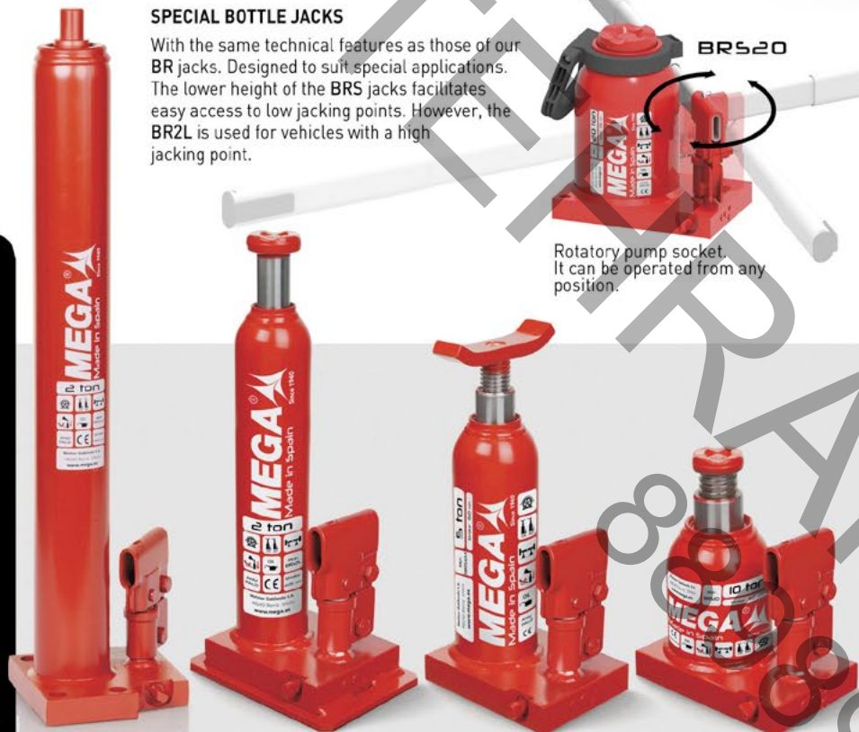
BR2LLC BR2L BR5EM BRS10