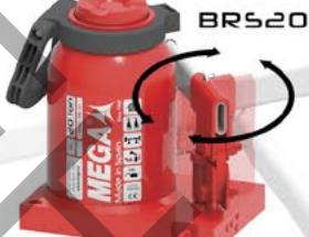
Rotatory pump socket. It can be operated from any position.

With the same technical features as those of our BR jacks. Designed to suit special applications. The lower height of the BRS jacks facilitates easy access to low jacking points. However, the BR2L is used for vehicles with a high jacking point.