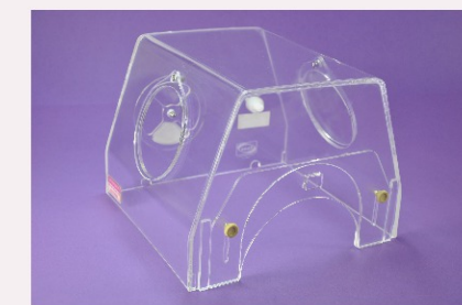
Oxygen Hood with side ports