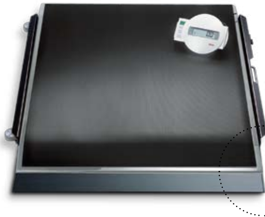
A ramp for easy roll-on of wheelchair is included in delivery.