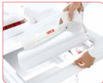
The measuring mat can be rolled up for space-saving storage.