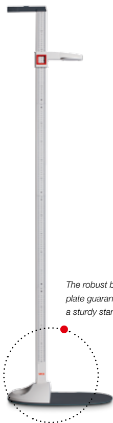
The robust base plate guarantees a sturdy stance.

The collapsible height measuring rod of the stadiometer seca 217 can be put together quickly and simply in just a few steps and attached to the stable platform. There's no need to attach the rod to the wall. It's easy to step onto the large base plate, which has no raised sides or edges.