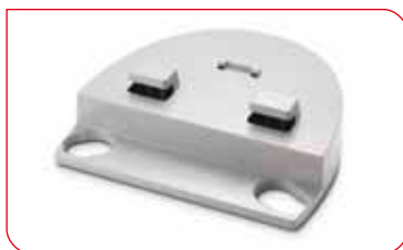
The seca 437 adapter element connects the stadiometer to a flat scale.

The measuring rod can be taken apart in just a few steps and conveniently carried anywhere with the integrated handle. For stationary use the seca 437 adapter element joins the stadiometer to a flat scale, such as the seca 876. The result is a weighing and measuring station that has proven itself in routine clinical work – as expected from the world market leader for medical weighing and measuring.