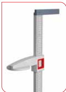
The spacer provides extra stability and ensures precise measurement results.

The mobile stadiometer seca 217 can be used anywhere, thanks to its sturdy and large base plate. All the connections are very stable and the spacer between wall and rod prevent the rod from wobbling and trembling, movements which impair measurement accuracy. All these features make this stadiometer the ideal tool for anyone who needs a reliable measuring device for use at different locations.